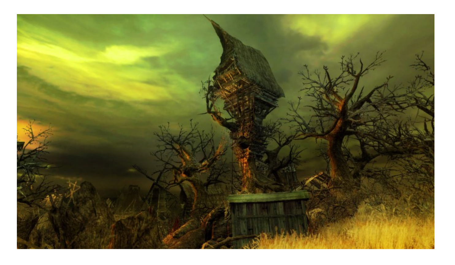
Pixel Draw - Expansion Pack 4 Download] [FULL]

Download >>> <a href="http://bit.lv/2SNBh38">http://bit.lv/2SNBh38</a>